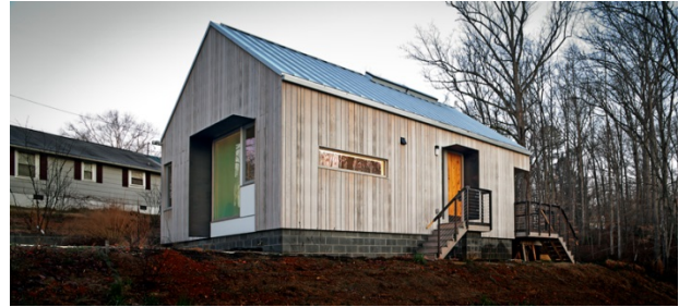
Figure 3: A New Norris House as seen from the street.

manner in order to disseminate effectively and demonstrate through comparative investigation that green building strategies require a significant investment, but are feasible and within reach of project teams.