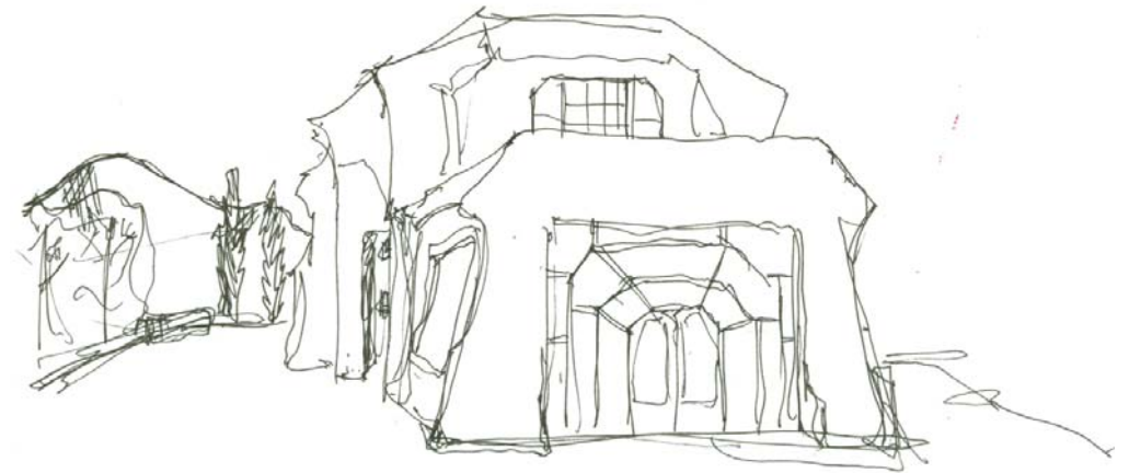
Goetheanum, Rudolf Steiner; Dornach, Switzerland; May 17, 2006; pen