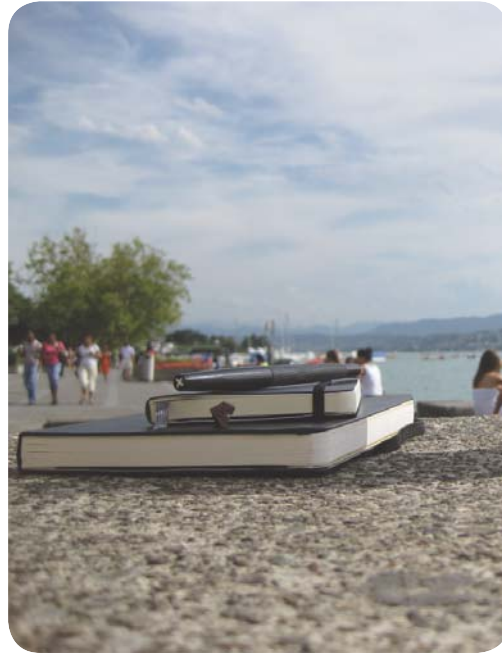
Sketching on Zürichsee (Lake Zürich)

Suffice it to say, the tour was extremely influential on me and would later influence my decision to return to Switzerland and study at the ETH Zürich during the autumn of 2009. During the trip, we were primarily based in three locations - Zürich, Flims, and Bellinzona. From these points, we completed day trips by bus to nearby places of interest. All in all, I cannot imagine a better way to spend nearly a month that drawing all day, eating nutella, and experiencing the architecture and culture of such a beautiful country.