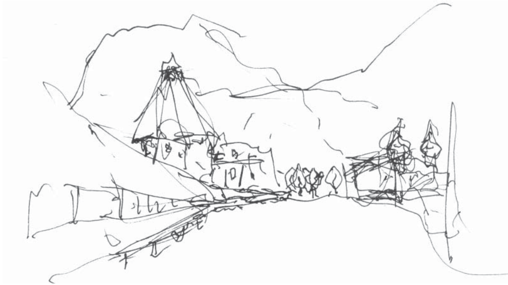
Medieval Bridge; Luzern, Switzerland; May 19, 2006; pen