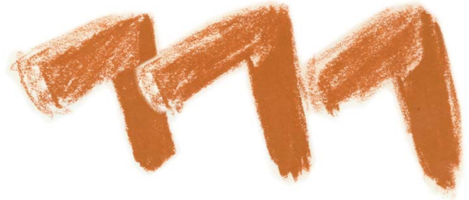
Castelgrande; Bellinzona, Switzerland; May 25, 2006; chalk pastel