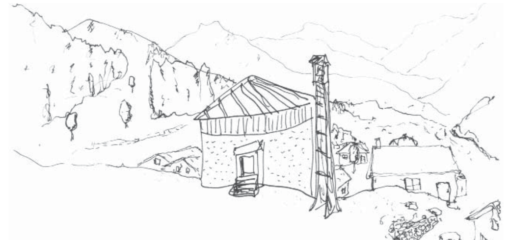
Saint Benedict Chapel, Peter Zumthor; Sumvitg, Switzerland; May 22, 2006; pen